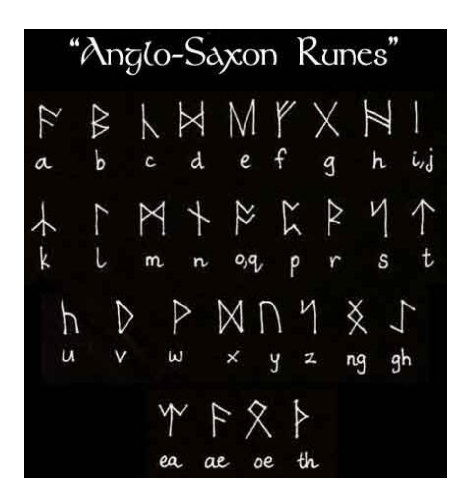
Fig. 6 – Anglo-Saxon Runes (cca. 1000 B.C.)