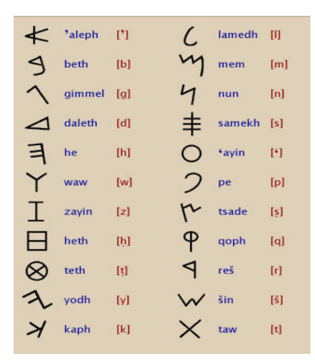
Fig. 3 The Phoenician Alphabet of 22 Consonants (1200 B.C.)