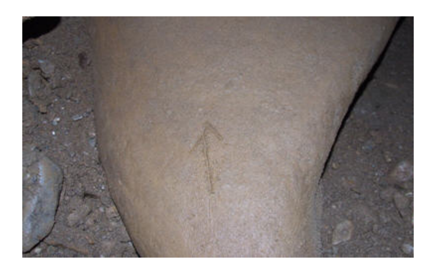
Figure 3 Digital photo of the deeply etched symbol, a pre-historic arrow, at the tail-end of the T-1 megalith

In Figure 1 we see the complete sketch of the thick cast stone slab of fine-grain yellowish-brown sandstone artistically shaped by the pre-historic builders. This sketch was drawn on the spot, in the tunnel on June 17, 2006, in the presence of the mining group, when the megalith had been uncovered. In Figure 2 is shown the cross-section of the tunnel at the place where the T-1 megalith is located. The following should be noted: