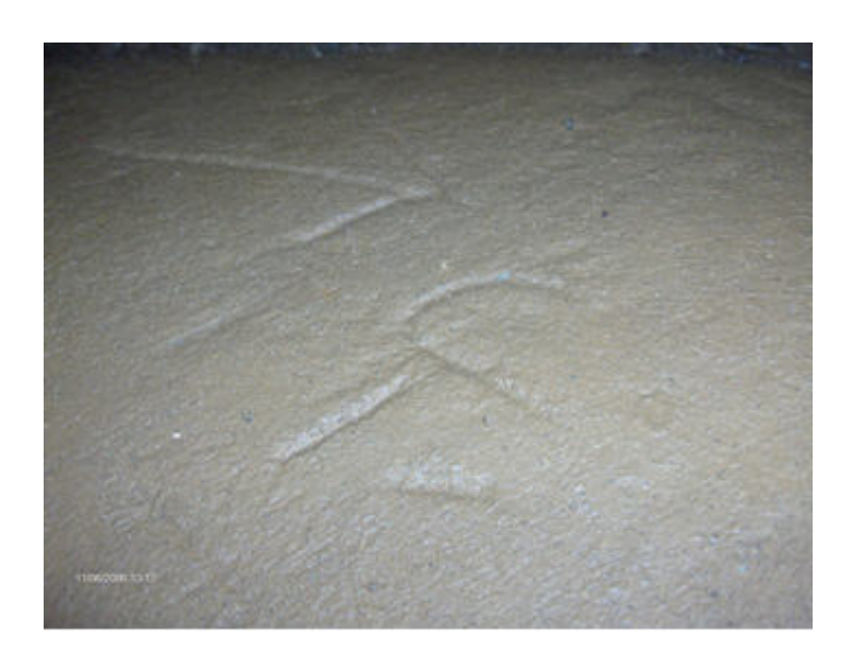
Fig. 4 Digital photo of a group of unknown symbols in the middle section of T-1

Third, the entire tunnel is dug through the marine breccia . This indicates that the marine breccia is older than the tunnel.