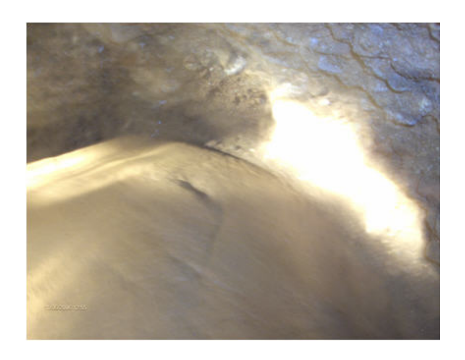
Fig. 5 Digital photo of a deeply engraved letter "tau" at the top of the back of T-1