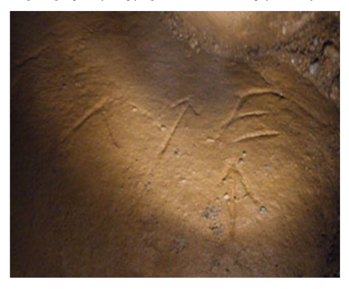
Fig. 6 Digital photo of a group of unknown symbols on the front of the T-1 megalith