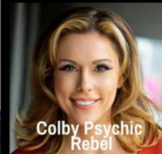
Colby Psychic Rebel