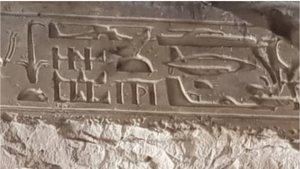
Abydos temple, military technology symbols?