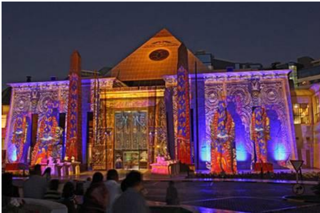
Philae Temple Light & Sound Show