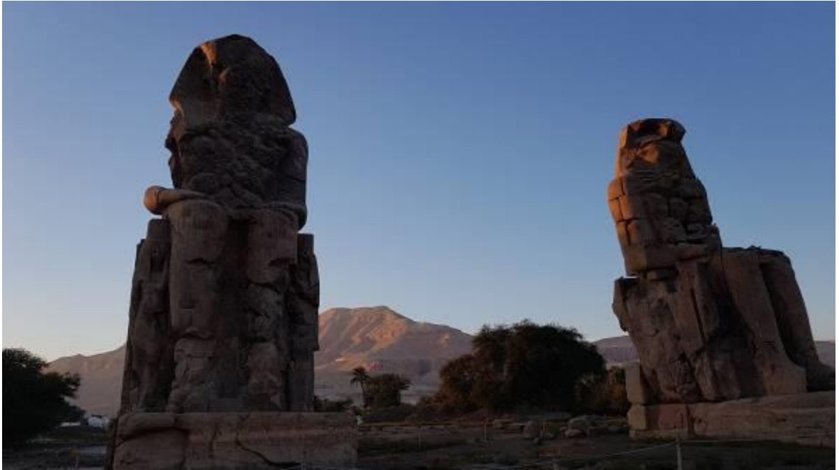
Colossi of Memnon