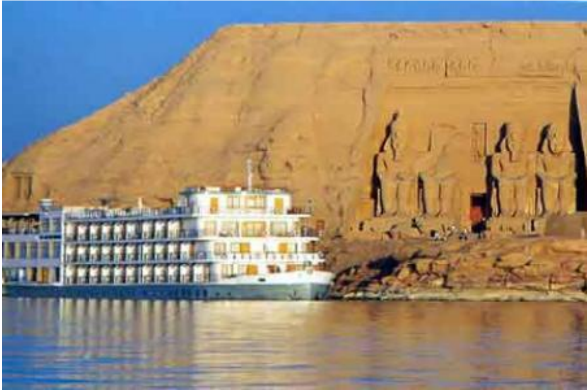
Nile cruise boat