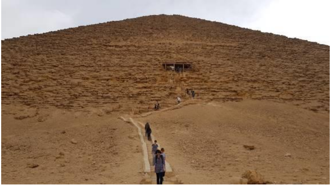
Red pyramid in Dahshur