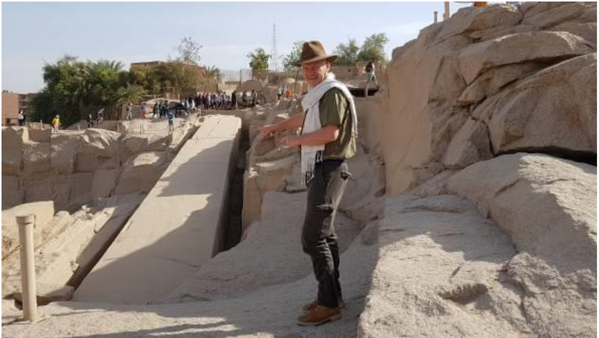
Unfinished 350-ton Obelisk in Aswan

Breakfast in hotel, check out and visit to: Unfinished Red Granite Obelisk in Aswan, The High Dam and Philae Temple (Temple of Isis) . Transfer to 5-star Nile Cruise on full board basis (open buffet style breakfast, lunch and dinner), while on board visits to Temple of Kom Ombo (Double Temple, Crocodile God), Temple of Edfu (Falcon God Horus) . Day trip by bus to Abydos: Temple of Osiris, Abydos King List, Temple of Seti I and trip to Dandera: Sacred Temple of Hathor and Zodiac signs . Note: during the cruise, Dr. Osmanagich will held lectures in the afternoon hours on pyramids around the world and true purpose of pyramids as energy machines, communication and healing devices.