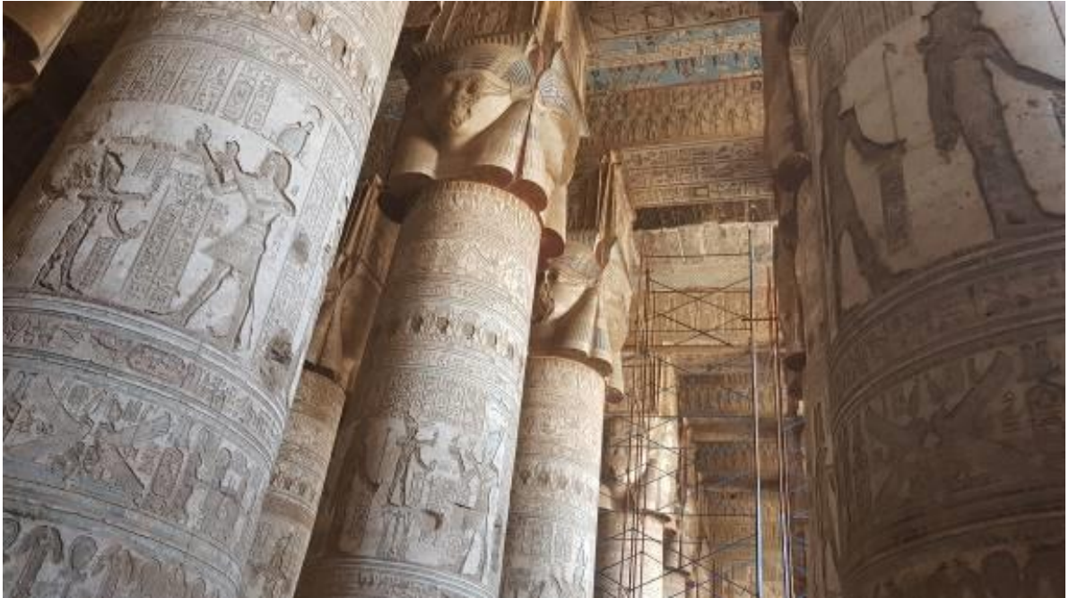
Temple of Hathor, Goddess of Love