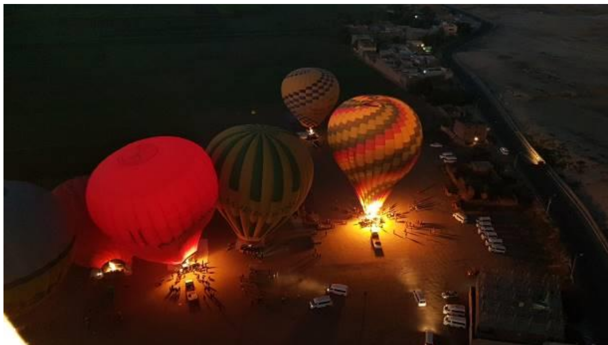
Optional: Hot Air Balloon ride during the sunrise over the Valley of the Kings and Karnak