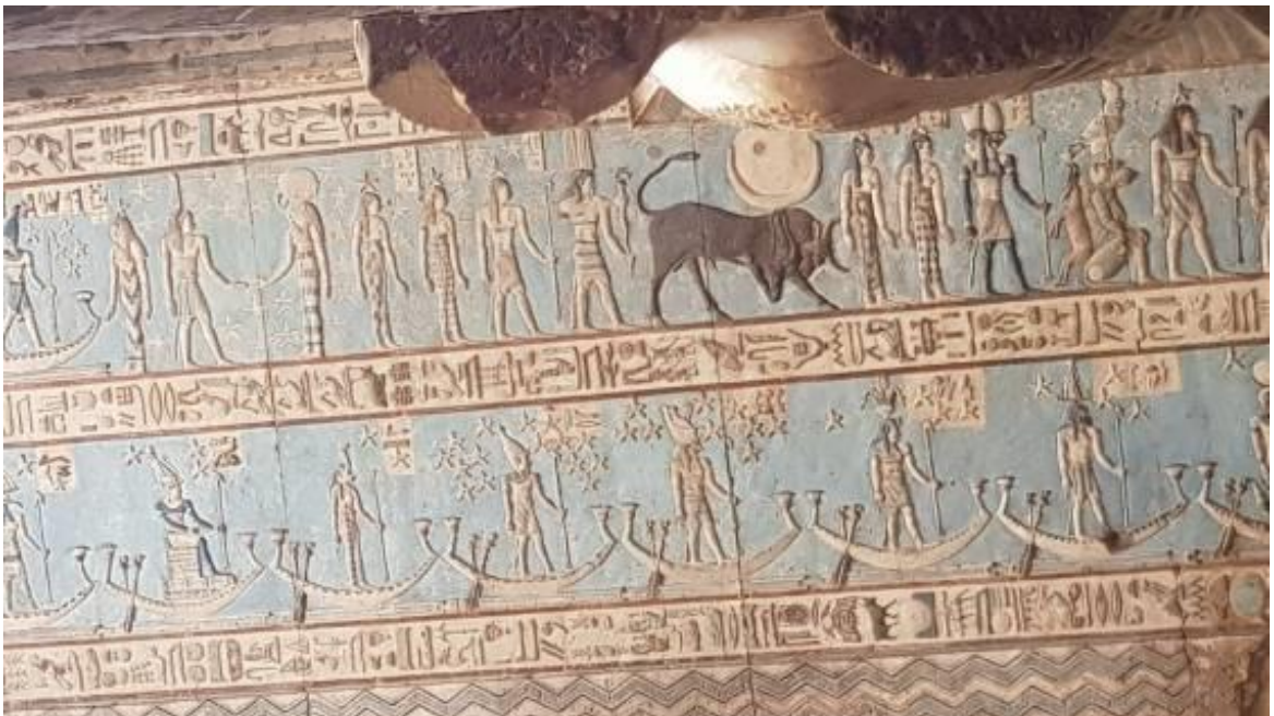
Dandera temple, Zodiac ceiling signs