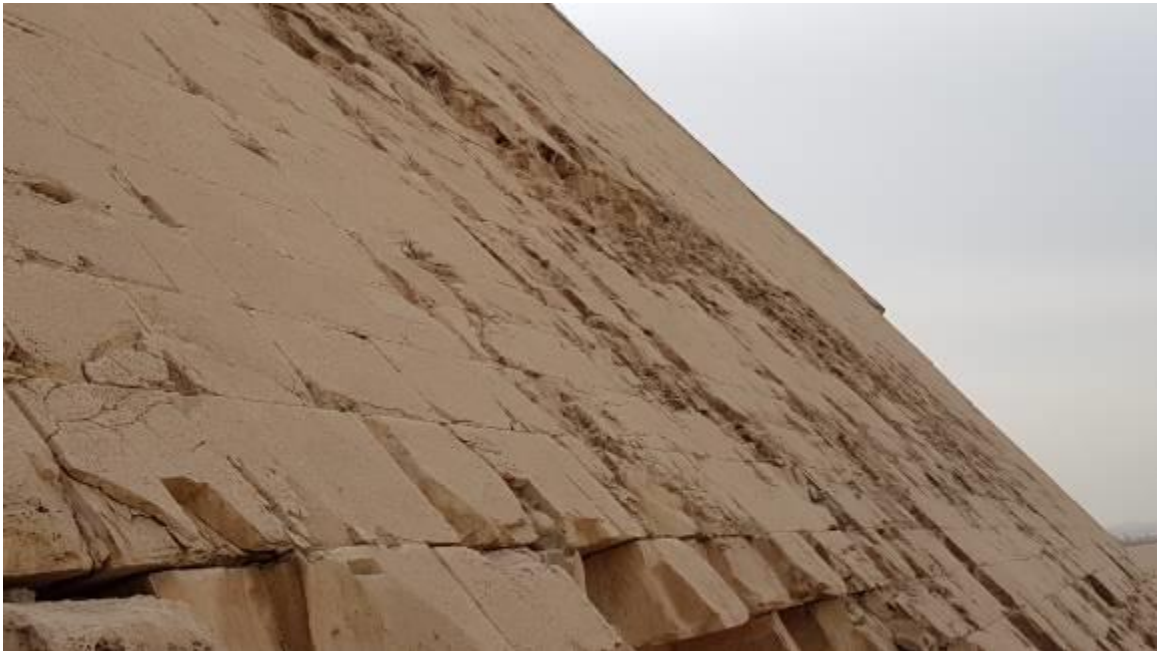
Bent pyramid in Dahshur