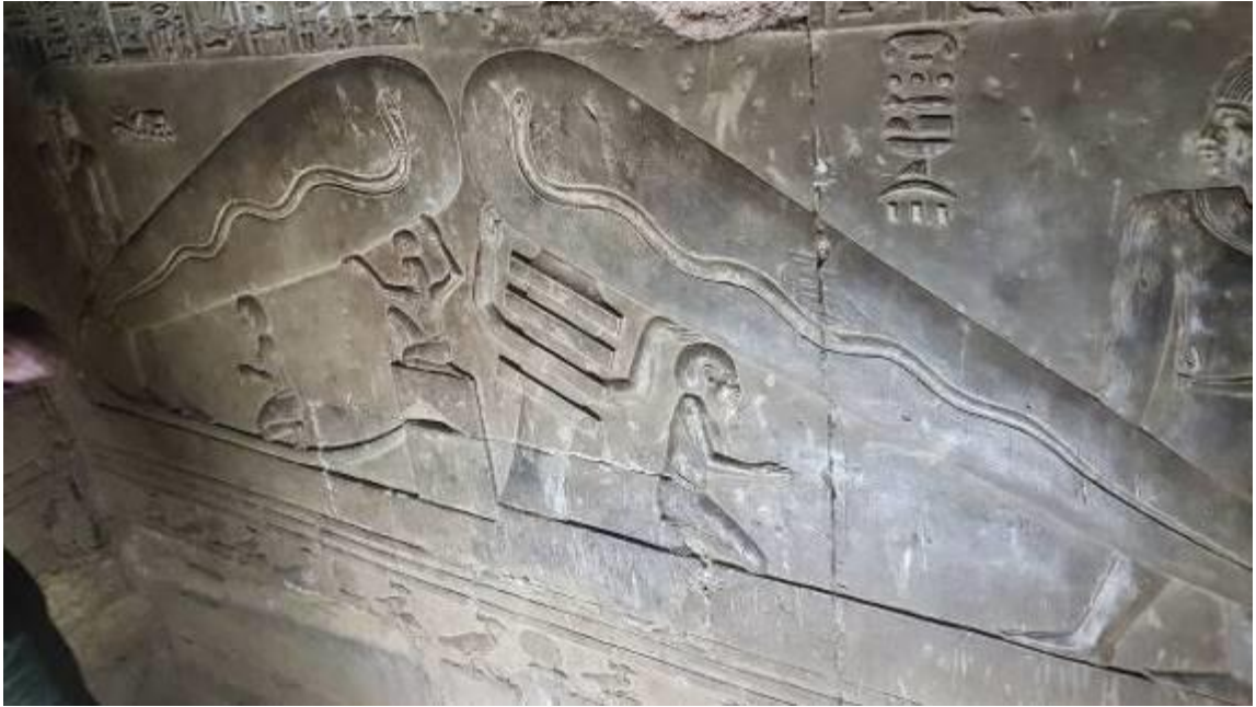
Abydos temple, technological devices?