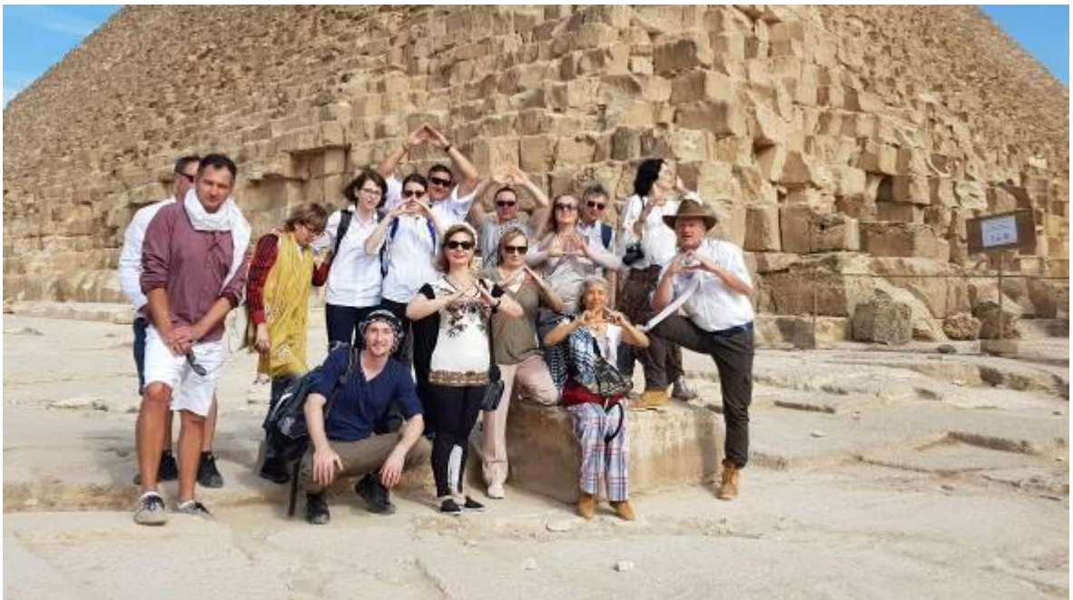
Great Pyramid of Egypt