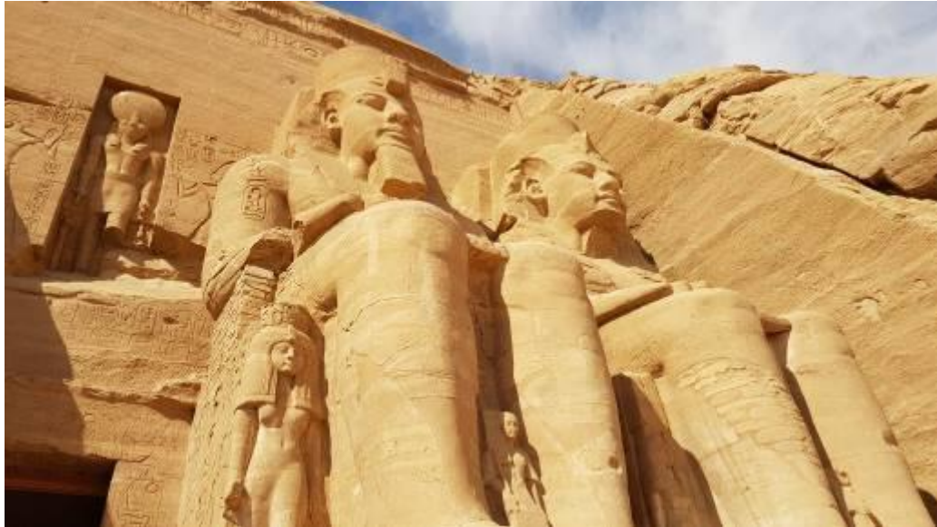
Abu Simbel Temple

Breakfast in hotel, transfer to Abu Simbel by bus, visit to Abu Simbel Temples (Great Temple of Ramesses II and Temple of Nefertari) . Transfer back to 5-star hotel “Helnan Aswan”, Philae Temple Sound & Light show , overnight in Aswan.