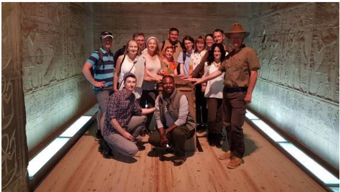
Inside the Philae Temple