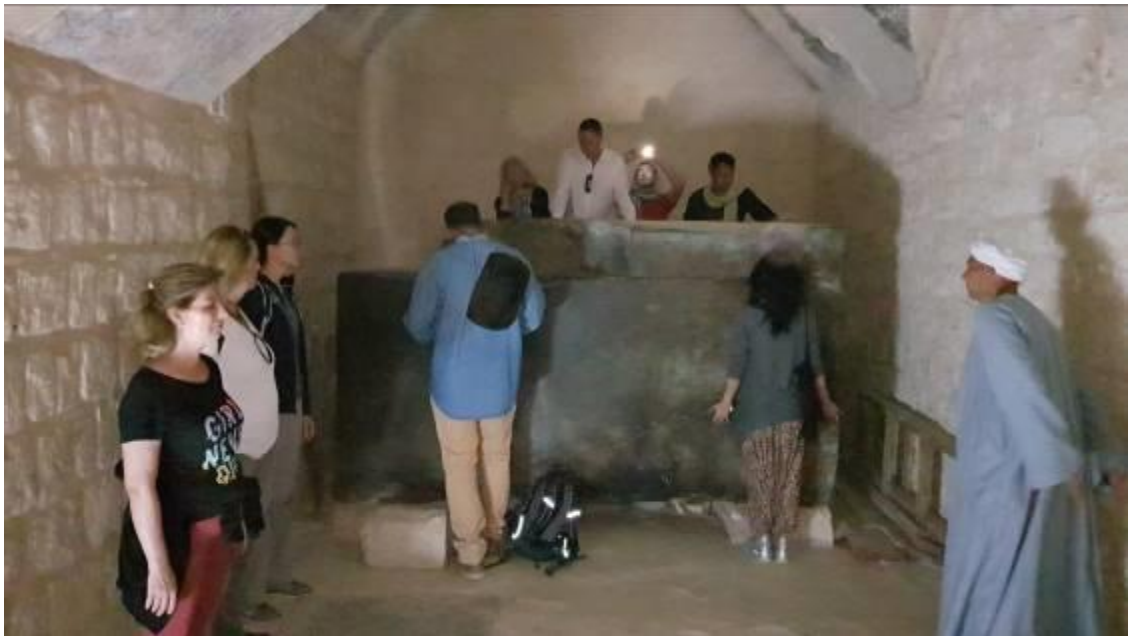
Chamber in Titi Pyramid