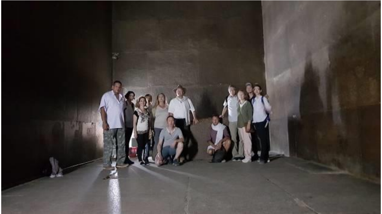
King Chamber, Great Pyramid of Egypt