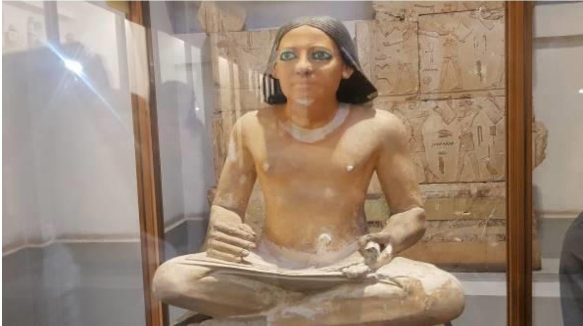
Scribe, Egyptian Museum in Cairo