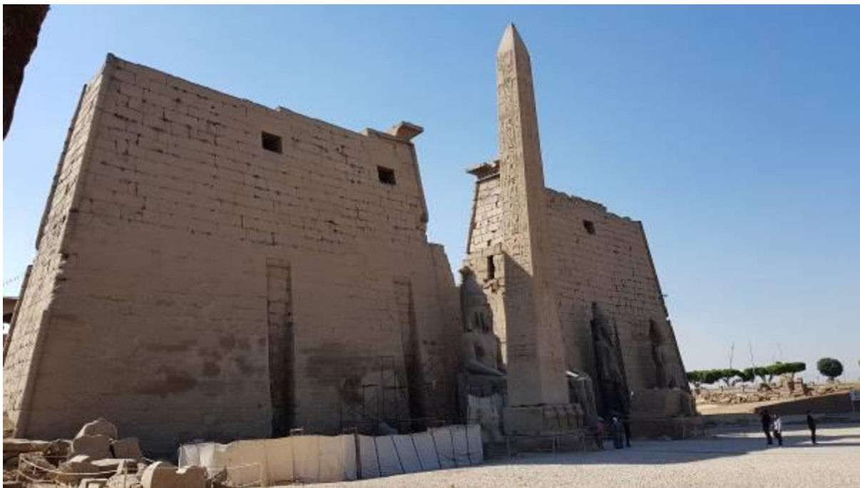
Luxor Temple complex