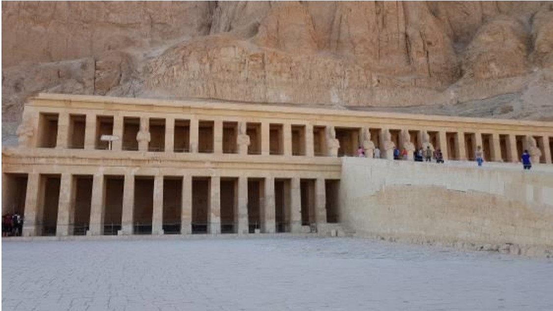
Queen Hatshepsut Temple

After breakfast, disembarkation from the cruise. Transfer to 5-star hotel “Mercure Luxor” in Karnak ( http://www.mercure.com/gb/hotel-9805-mercure-luxor-karnak/index.shtml ). Visit to: Valley of the Kings, Queen Hatshepsut Temple, Colossi of Memnon (King Amenhotep III).