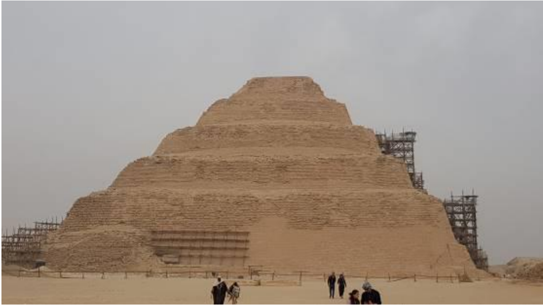
Step pyramid in Sakara