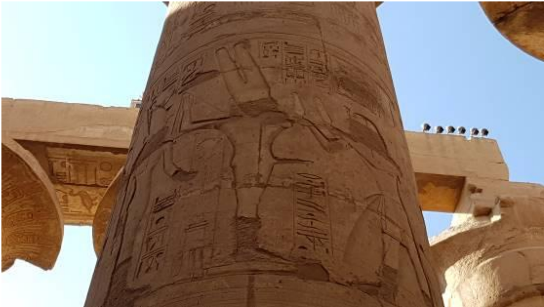
Karnak Temple, Osiris and Isis