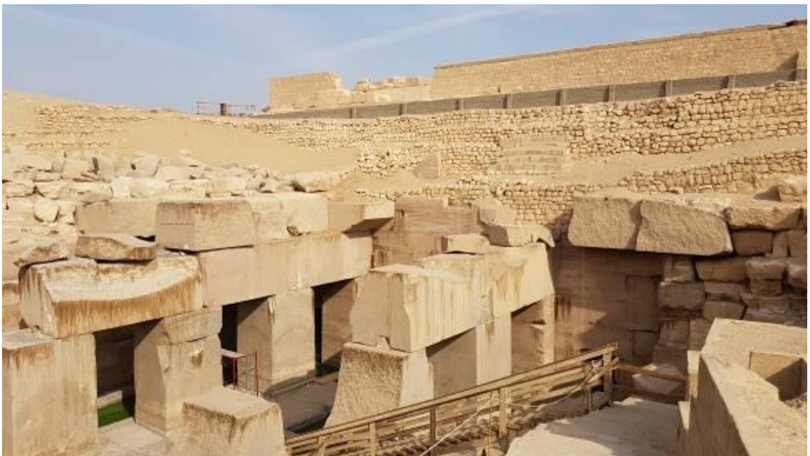
Abydos 60-ton Megaliths