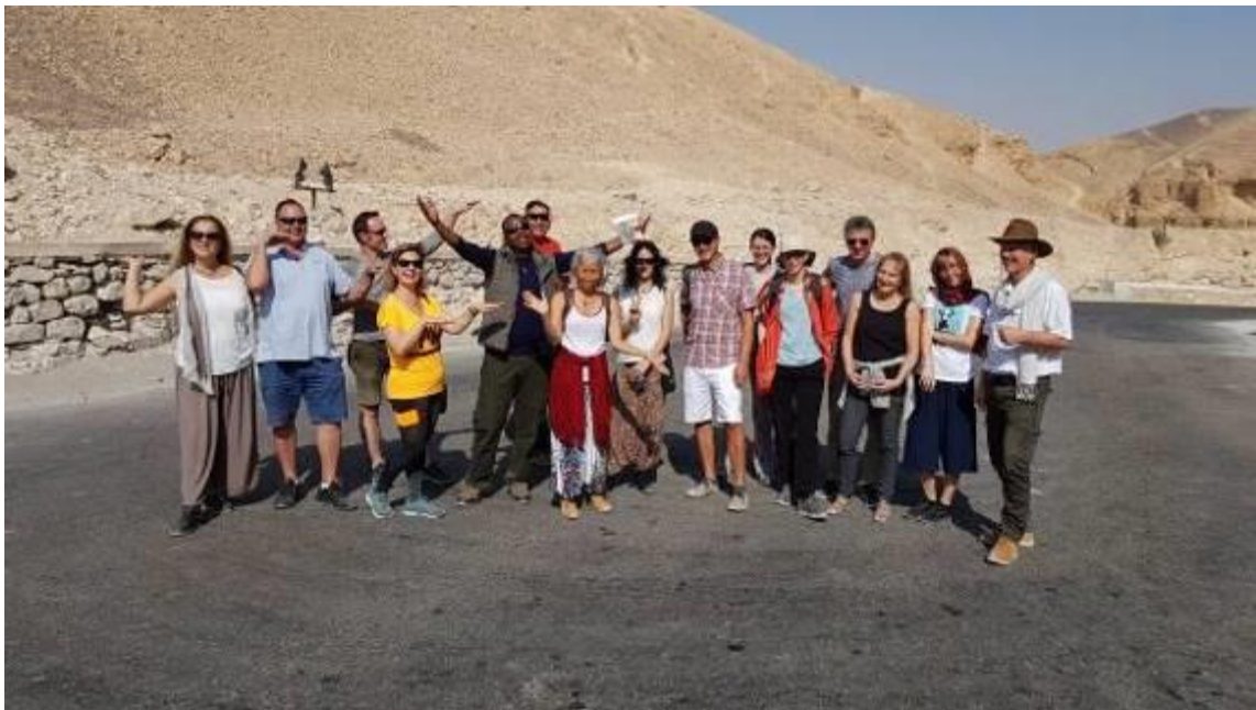
Valley of the Kings