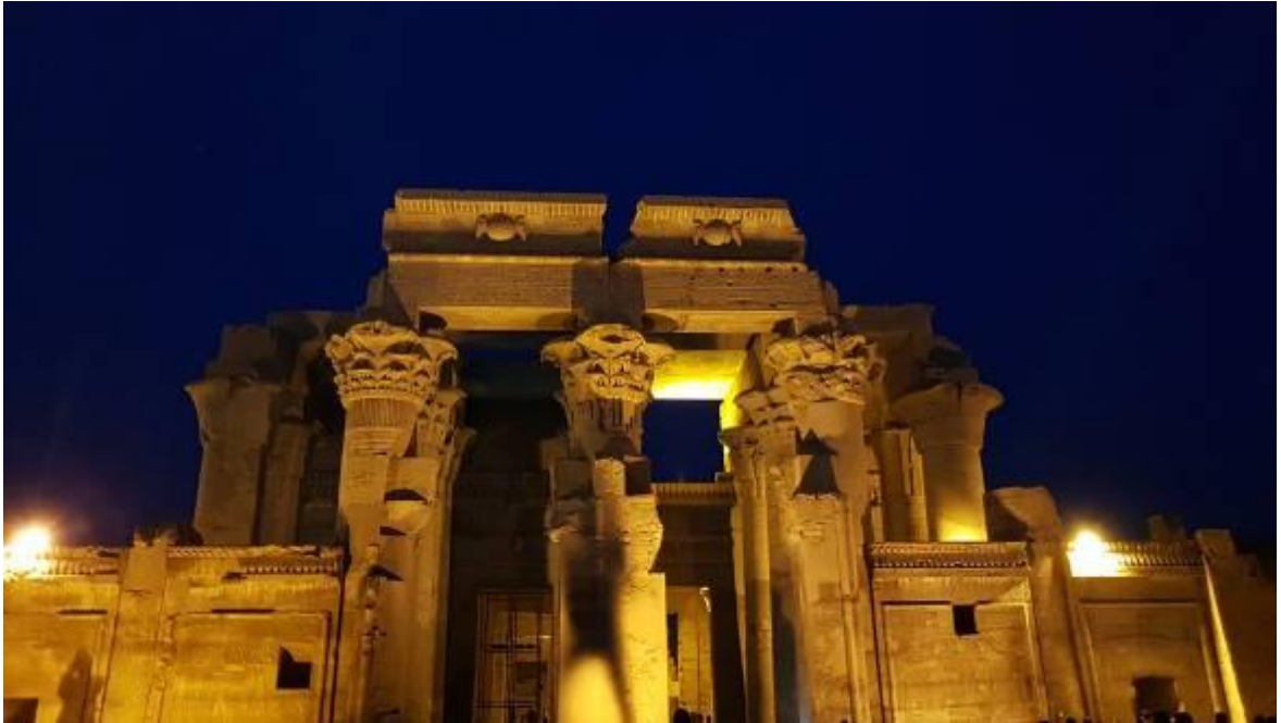
Double Temple of Kom Ombo, night visit