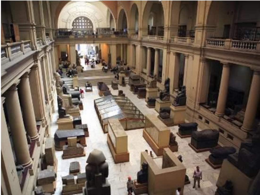
Egyptian Museum in Cairo

After breakfast, transfer to Luxor airport, early departure for Cairo, meet & assist by local guide, visit to Egyptian Museum in Cairo , transfer to 5-star hotel “Steigenberger” in Cairo-Giza https://www.steigenberger.com/en/hotels/all-hotels/egypt/cairo/cairo-pyramids-hotel , evening Light & Sound Show in Giza , overnight in Cairo.