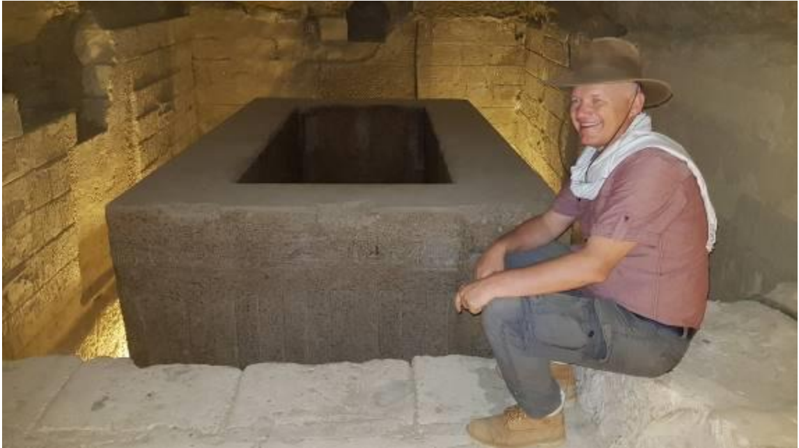
Serapeum, 100-ton black granite subterranean blocks