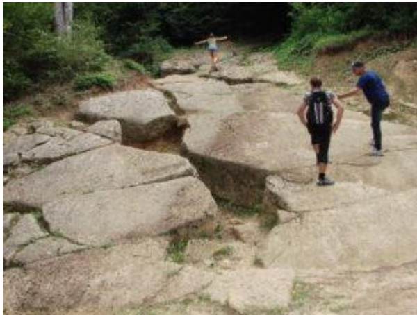
Photo – Pavement uncovered on the flat top of the Pyramid of the Moon, left.

Trekking around some of five known pyramids and associated tunnels of nearby Ravne, I got the impression (as have others) that other-worldly beings were involved in the creation of these huge structures in the ancient past, perhaps around 30,000 years ago, according to scientific dating (humans have lived in the region for around 35,000 years). I also sensed the ongoing presence of