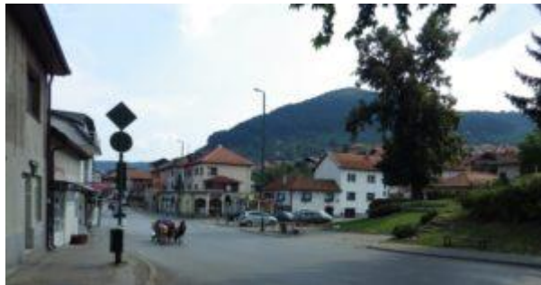
Photo – The Pyramid of the Sun, behind Visoko town

Visoko itself is a charming old town nestled in a permaculture paradise with fruit filled trees and vegetable and raspberry plots everywhere. My accommodation was on the edge of town, on the banks of a wild river. When the (live) call to prayer rang out from the town's minarets (locals are 90% Muslim) – it mingled with the sound of rushing water and sounded like a magical blessing on all. Around the fertile valley the awesome spectre of several huge pyramids cloaked in scrubby oak forests loomed enigmatically, harbouring fabulous secrets and known to be geometrically aligned to the Earth, cosmos and each other. Here the Sky connects with the Earth in spectacular ways!