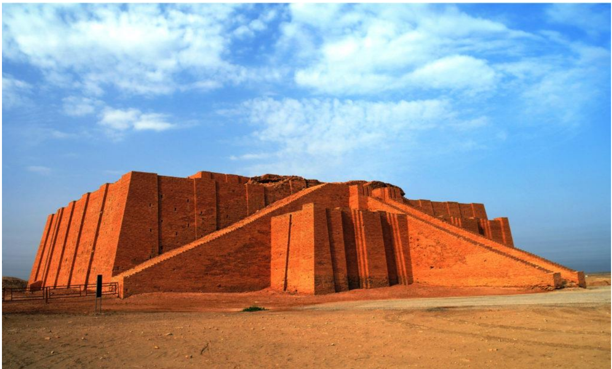
A Sumerian Ziggurat

There is some crossover in the biblical texts of Enoch and ancient Sumerian texts, particularly when it comes to the Watchers. Known as the Annunaki, or visitors from a planet called Nibiru, the Sumerians also looked upon these Watchers as gods, showing a crossover between the two ancient cultures. There is also mention of the great Sumerian ruler, Gilgamesh, in the Book of Enoch, who often describes the Annunaki in much the same way that Enoch describes the Watchers.