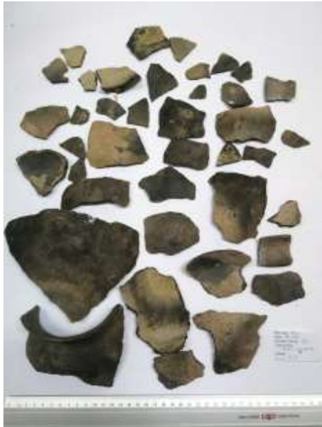
Figure 1: Fragments of first pot with line ornaments