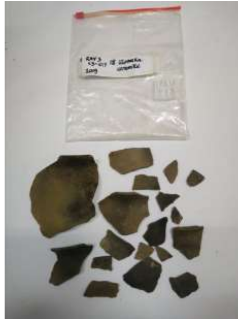
Figure 2: Fragments of second pot with inventory number C3016, O17, 018 RAV3