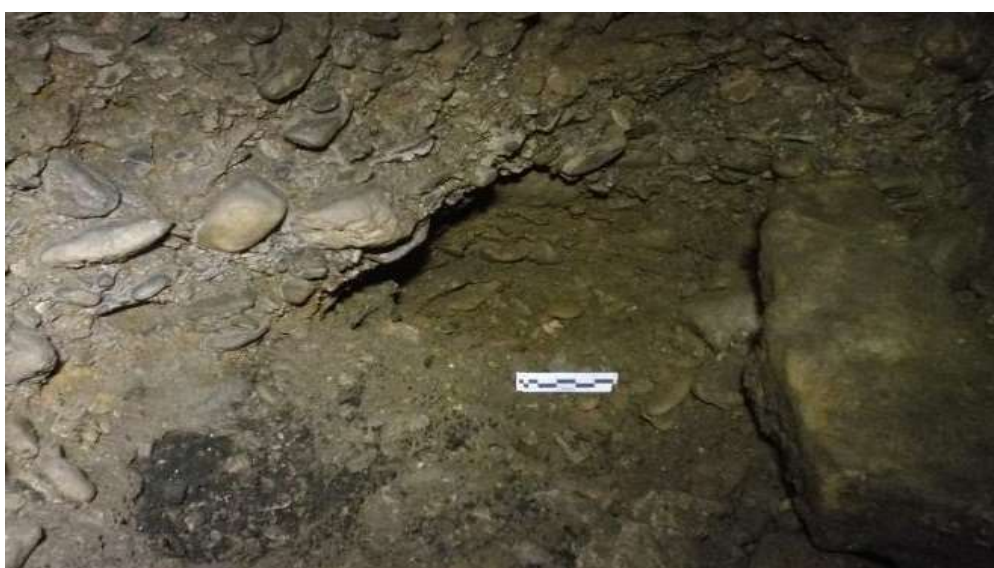
Figure 5: The place where ceramic fragments were found, February 2019