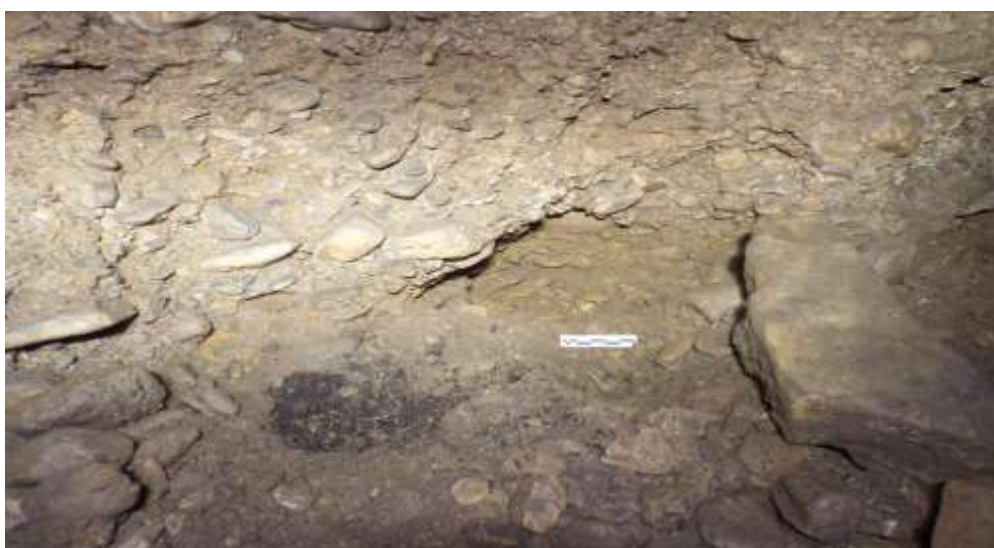
Figure 6: The place where ceramic fragments were found, February 2019