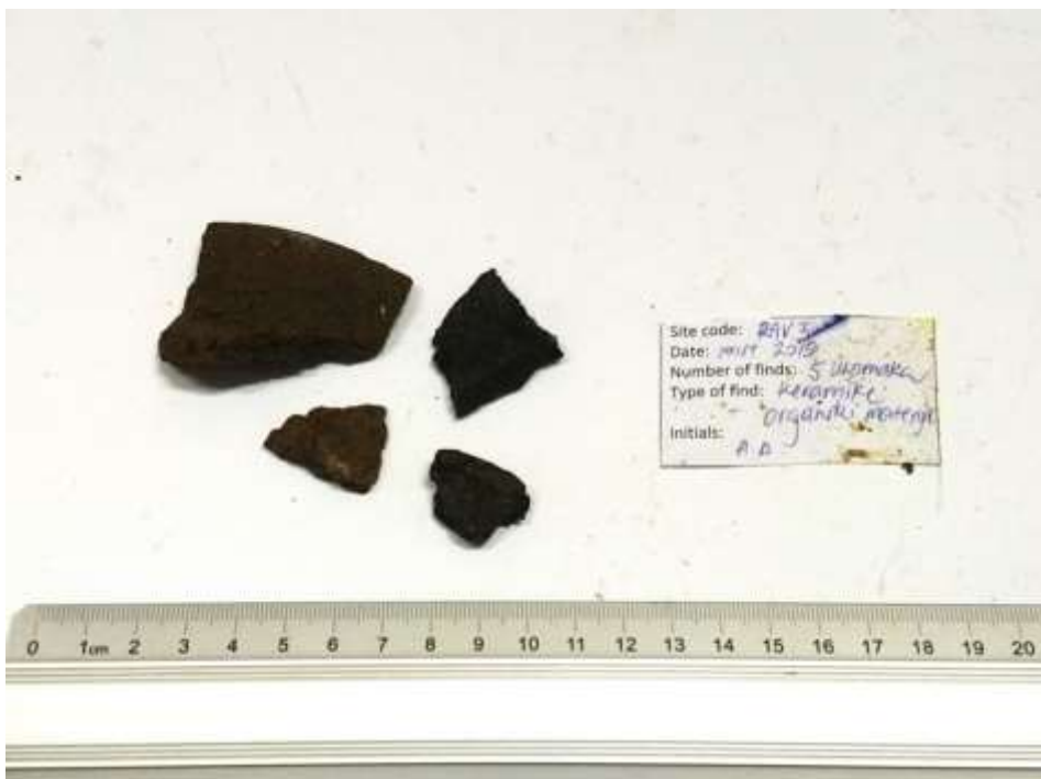
Figure 3: Fragments that we found afterware in March 2019