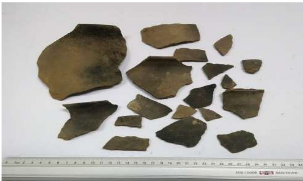
Figure 4: Fragments from Ravne 3 tunnel, February 2019.