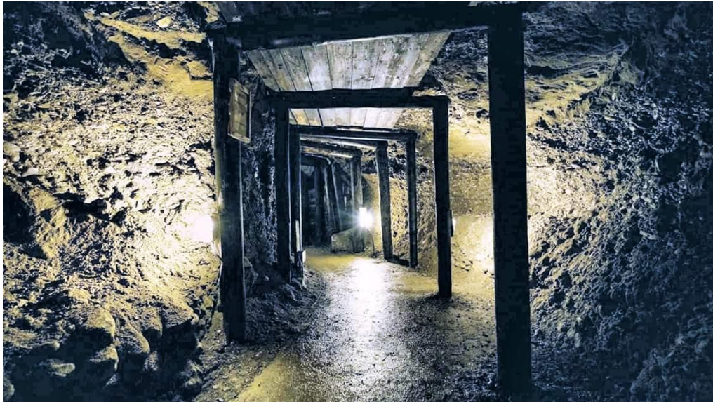
Underground Labyrinth Ravne