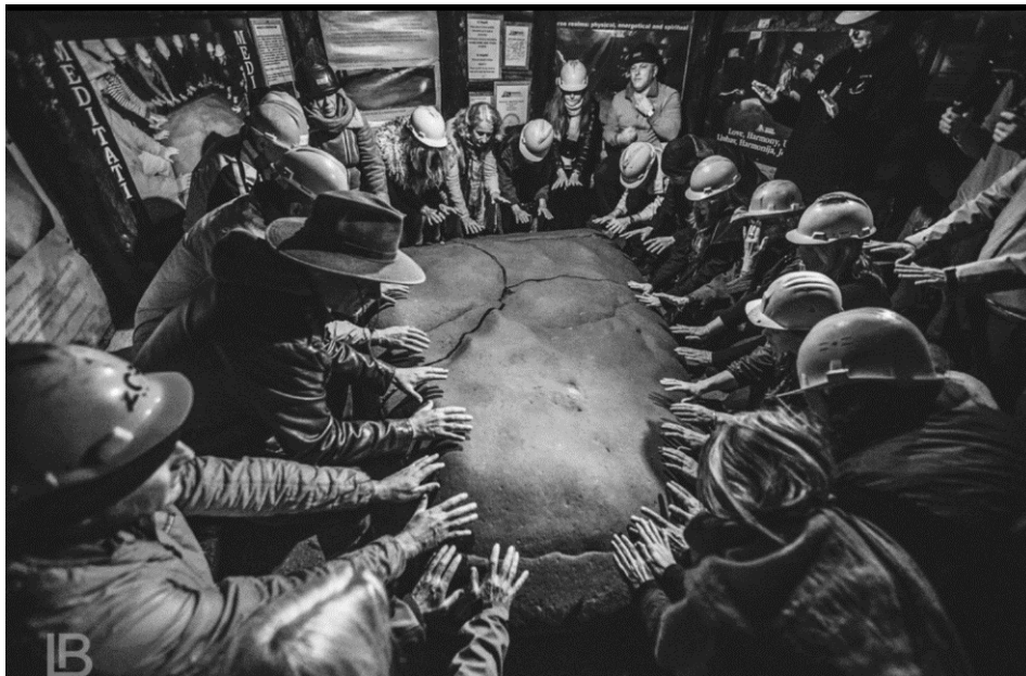
Meditation in Underground Labyrinth Ravne