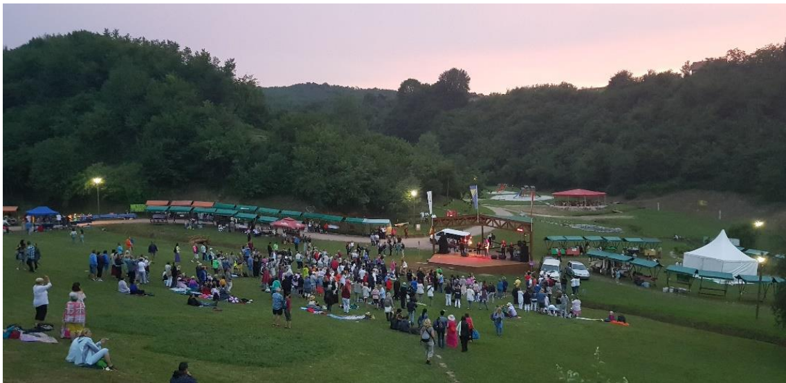
Park Ravne 2