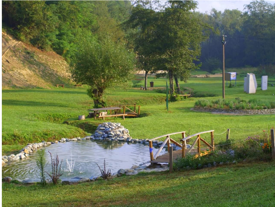
Park Ravne 2