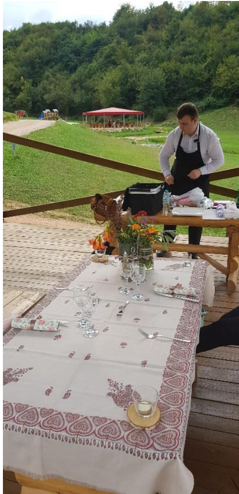
Homemade, organic food in Park