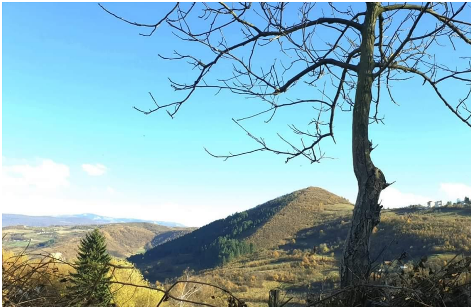
Bosnian pyramid of the Sun