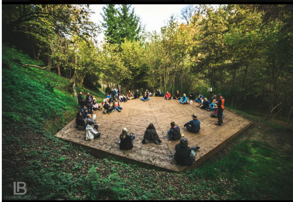
Park Ravne 2